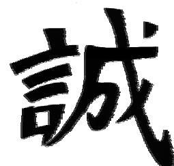
Figure 2. Makoto symbol