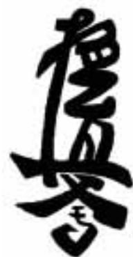
Figure 3. Assistant to a Chief Instructor symbol